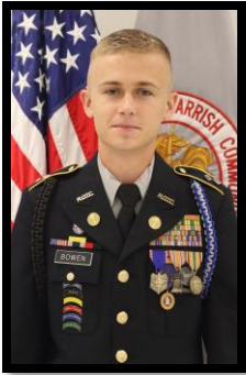
Command Sergeant Major